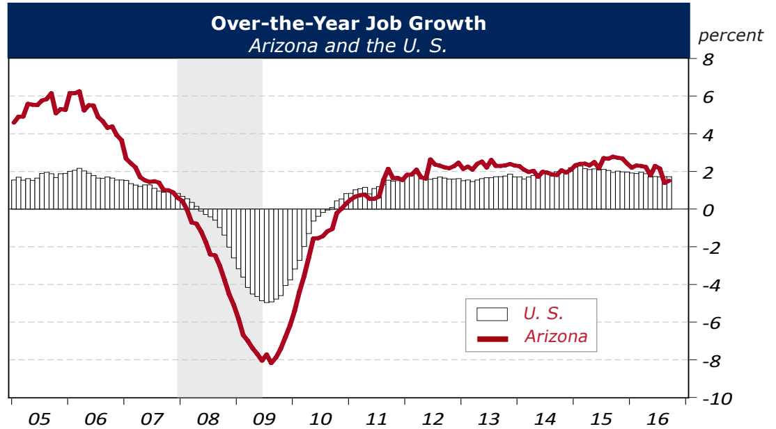
Exhibit 1: Arizona and U.S. Job Gains Slowed During the Summer

"On average during September, one U.S. dollar bought 19.24 pesos, which was 48.1% higher than in June 2014. "